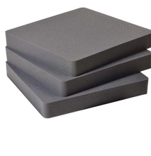
1642 Pick N Pluck™ Sections Only (set of 3)