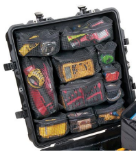
0379 Lid Organizer