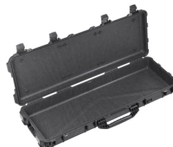
1720NF No Foam