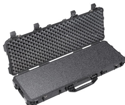
1720WF With Foam