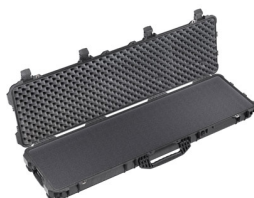
1750WF With Foam