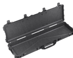
1750NF No Foam