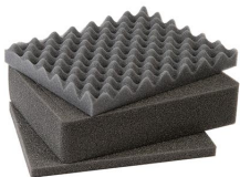
1201 3 pc. Replacement Foam Set