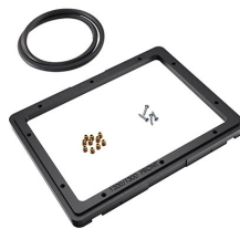
1200PF Special Application Panel Frame