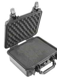
1200WF With Foam