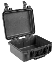
1200NF No Foam