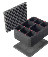
1200TPKIT TrekPak Case Divider Kit