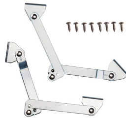
KIT-LIDSTAY-CARGO Cargo Lid Stays