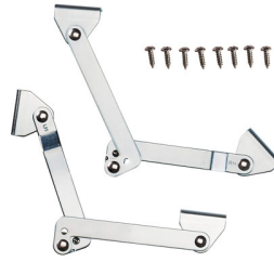
KIT-LIDSTAY-CARGO Cargo Lid Stays