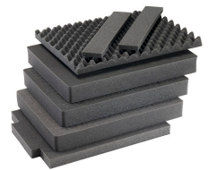
1607AirFS 7 pc. Replacement Foam Set