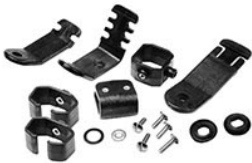
0770 Helmet Light Holder