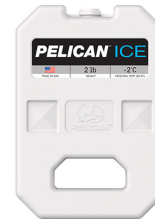
PI-2LB 2lb Ice Pack