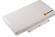
65-95QSEAT Seat Cushion - White