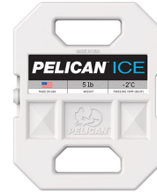
PI-5LB 5lb Ice Pack