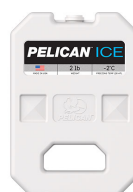
PI-2LB 2lb Ice Pack