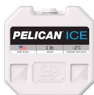
PI-1LB 1lb Ice Pack