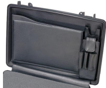
1498 Computer Lid Organizer