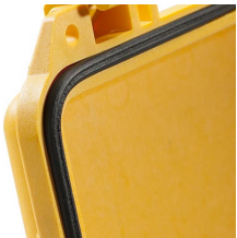
1493 Replacement O-ring