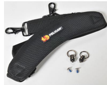
1472 Shoulder Strap