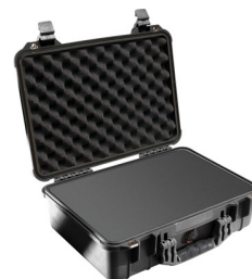
1500WF With Foam