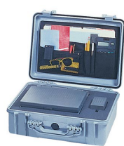
1509 Lid Organizer