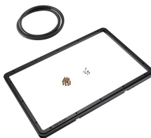
1500PF Special Application Panel Frame