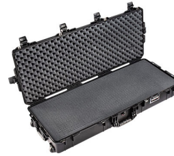
1745WF With Foam