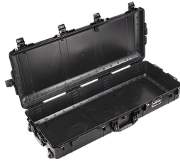
1745NF No Foam