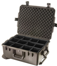
iM2720-X0002 With Padded Dividers