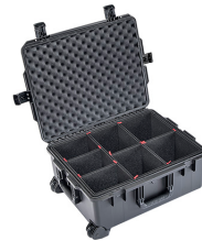
iM2720-X0006 With TrekPak Divider System