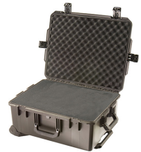
iM2720-X0001 With Foam