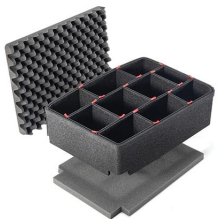
iM2720TPKIT TrekPak Case Divider Kit