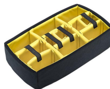
iM2500-DIV Padded Divider Set