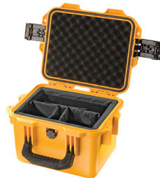
iM2075-X0002 With Padded Dividers