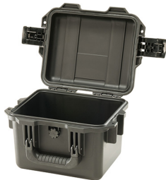
iM2075-X0000 No Foam