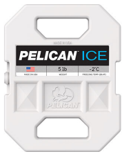
PI-5LB 5lb Ice Pack