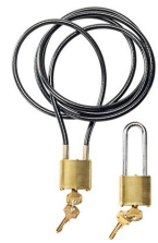
CL2 Cable Lock (2 pack)