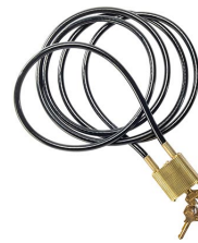
CL1 Cable Lock