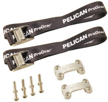
TDKIT Tie Down Kit

23215 Early Ave • Torrance, CA 90505 USA • Phone: (310) 326-4700 • (800) 473-5422 • Fax: (310) 326-3311 sales@pelican.com • www.pelican.com