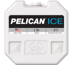
PI-1LB 1lb Ice Pack