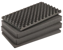
1555AirFS 4 pc. Replacement Foam Set