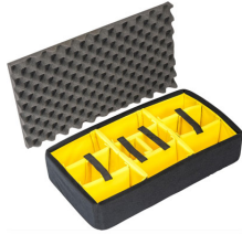
1555AirDS Padded Divider Set