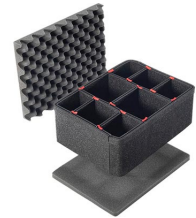
1120TPKIT TrekPak Case Divider Kit