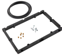
1120PF Special Application Panel Frame