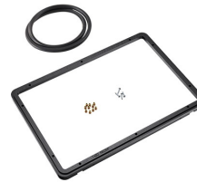
1450PF Special Application Panel Frame