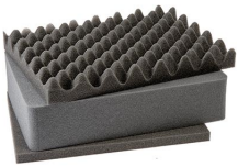
1451 3 pc. Replacement Foam Set