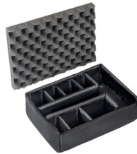
1455 Padded Divider Set