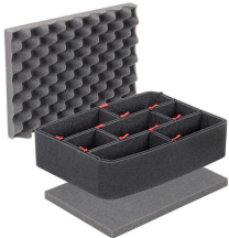
1450TPKIT TrekPak Case Divider Kit