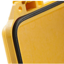
1453 Replacement O-ring