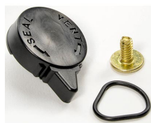
iM-VALVE-M-B Manual Purge Valve