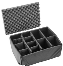
iM2620-DIV Padded Divider Set