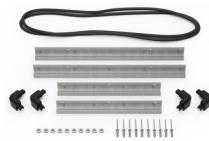
iM2450-BEZEL Base Bezel Kit