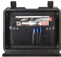
iM24XX-LIDORG Lid Organizer