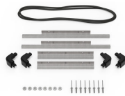
iM2200-BEZEL-LID Lid Bezel Kit