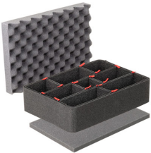
iM2200TPKIT TrekPak Case Divider Kit