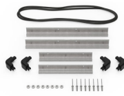
iM2200-BEZEL Base Bezel Kit