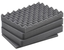
iM2200-FOAM 4 pc. Replacement Foam Set