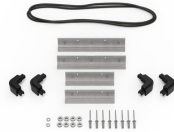
iM20XX-M4-BEZEL Base Bezel Kit (Metric)