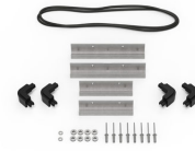
iM20XX-M4-BEZEL Base Bezel Kit (Metric)