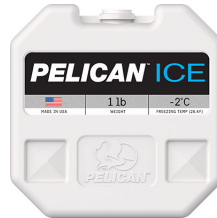
PI-1LB 1lb Ice Pack