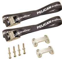
TDKIT Tie Down Kit