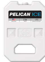
PI-2LB 2lb Ice Pack

Pelican 23215 Early Ave • Torrance, CA 90505 USA • Phone: (310) 326-4700 • (800) 473-5422 • Fax: (310) 326-3311 sales@pelican.com • www.pelican.com