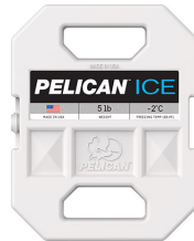
PI-5LB 5lb Ice Pack