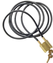
CL1 Cable Lock