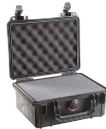
1150WF With Foam