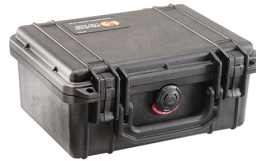
1150NF No Foam