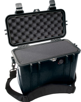
1430WF With Foam