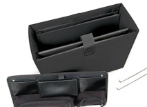
1436 Office Divider Kit