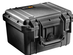
1300NF No Foam