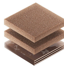
1500CI Corrosion Intercept Kit