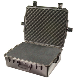
iM2700-X0001 With Foam