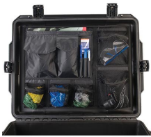
iM27XX-UTILITYORG Utility Organizer