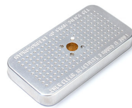
1500D Desiccant Silica Gel