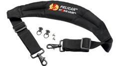
iM-STRAP-S-VER2 Padded Shoulder Strap