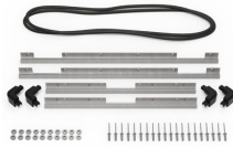
iM2700-BEZEL-LID Lid Bezel Kit