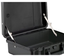
iM-LIDSTAY Lid Stay