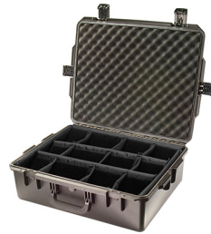
iM2700-X0002 With Padded Dividers