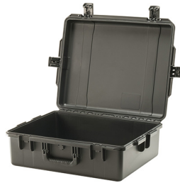
iM2700-X0000 No Foam