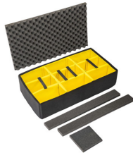
1615AirDS Padded Divider Set