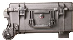
1560MNF No Foam