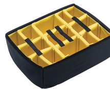
1565 Padded Divider Set