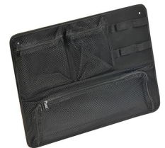
1569 Lid Organizer