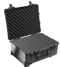
1560WF With Foam