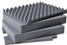
1561 4 pc. Replacement Foam Set