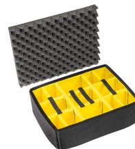
1565 Padded Divider Set