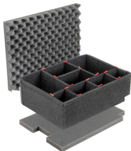
1560TPKIT TrekPak Case Divider Kit