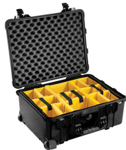
1564 With Padded Dividers