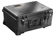
1560NF No Foam