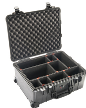
1560TP With TrekPak Divider System