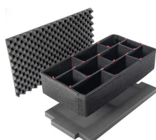
IM2950TPKIT TrekPak Case Divider Kit