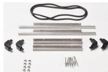
iM2306-BEZEL-LID Lid Bezel Kit