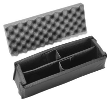
iM2306-DIV Padded Divider Set