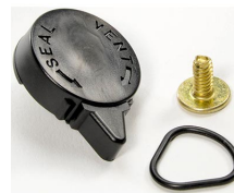
iM-VALVE-M-B Manual Purge Valve