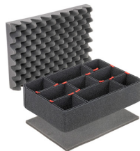
iM2300TPKIT TrekPak Case Divider Kit