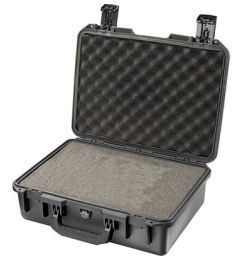
iM2300-X0001 With Foam