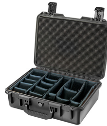
iM2300-X0002 With Padded Dividers