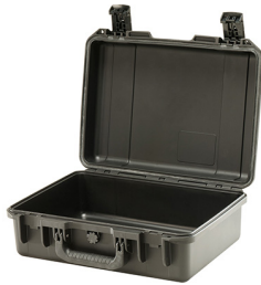
iM2300-X0000 No Foam