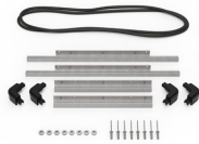
iM2300-BEZEL-LID Lid Bezel Kit