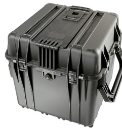
0340NF No Foam