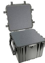
0340WF With Foam