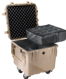
0344 With Padded Dividers