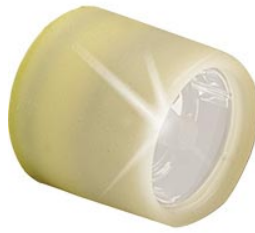
2413PL Photoluminescent Shroud

23215 Early Ave • Torrance, CA 90505 USA • Phone: (310) 326-4700 • (800) 473-5422 • Fax: (310) 326-3311 sales@pelican.com • www.pelican.com