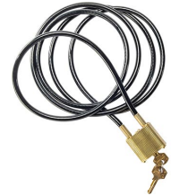
CL1 Cable Lock