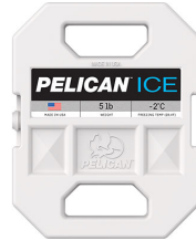
PI-5LB 5lb Ice Pack