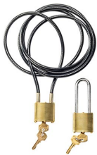
CL2 Cable Lock (2 pack)