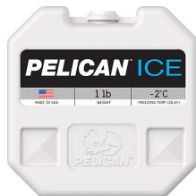
PI-1LB 1lb Ice Pack