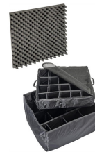
1635 Padded Divider Set