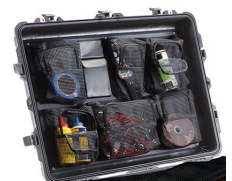
1639 Lid Organizer