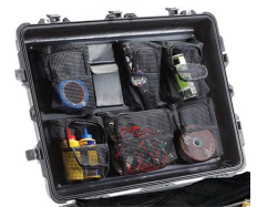
1639 Lid Organizer