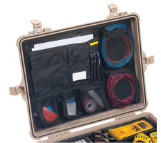
1609 Lid Organizer