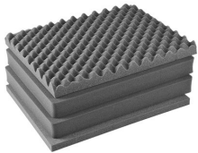
1601 4 pc. Replacement Foam Set