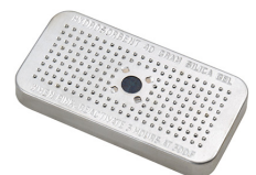
1500D Desiccant Silica Gel