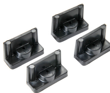
1507 Quick Mounts - set of 4