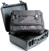
1527 Convertible Travel Bag Only