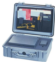
1509 Lid Organizer