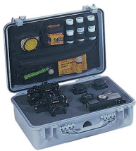
1508 Photographer's Lid Organizer