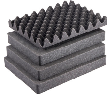
1507AirFS 5 pc. Replacement Foam Set