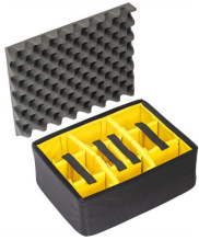
1507AirDS Padded Divider Set