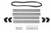
iM2275-BEZEL-LID Lid Bezel Kit