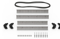
iM2275-BEZEL Base Bezel Kit