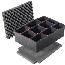
iM2275TPKIT TrekPak Case Divider Kit