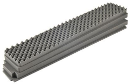
iM3410-FOAM 4 pc. Replacement Foam Set