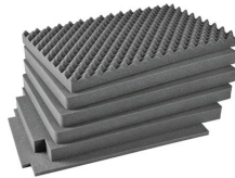
iM2950-FOAM 6 pc. Replacement Foam Set