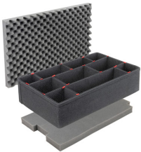
iM2950TPKIT TrekPak Case Divider Kit