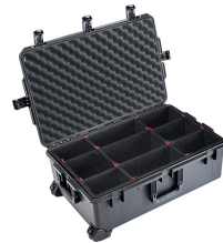
iM2950-X0006 With TrekPak Divider System