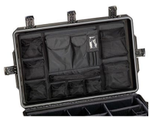
iM29XX-UTILITYORG Utility Organizer