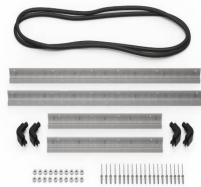
iM2950-BEZEL Base Bezel Kit