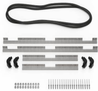
iM2950-BEZEL-LID Lid Bezel Kit