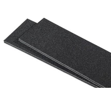
iM2950TPDIV Extra TrekPak Dividers