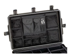
iM29XX-UTILITYORG Utility Organizer