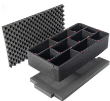
iM2950TPKIT TrekPak Case Divider Kit