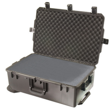
iM2950-X0001 With Foam