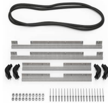
iM2750-BEZEL-LID Lid Bezel Kit