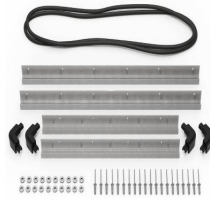
iM2700-BEZEL Base Bezel Kit